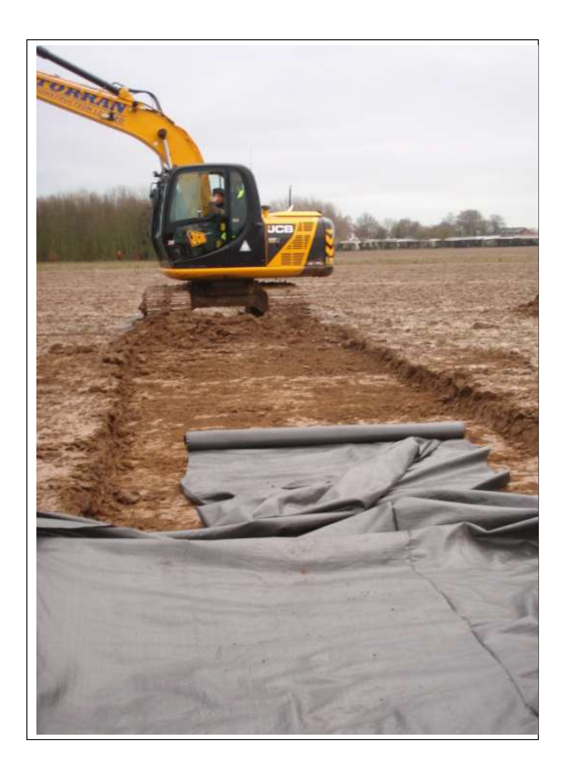
Plate 2. Access road construction with ditching bucket (looking east)