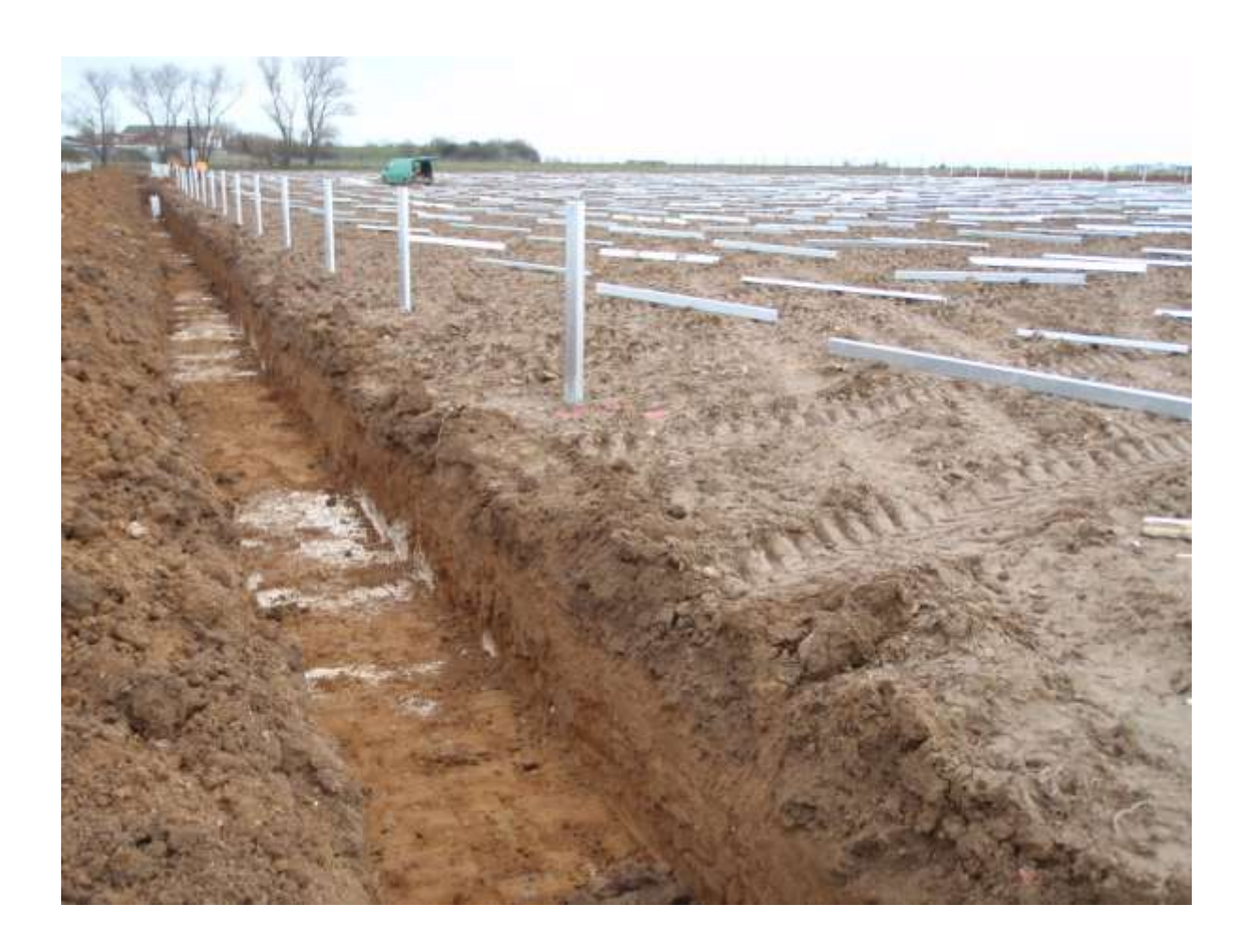
Plate 4. Main cable runs excavated with ditching bucket (looking north)