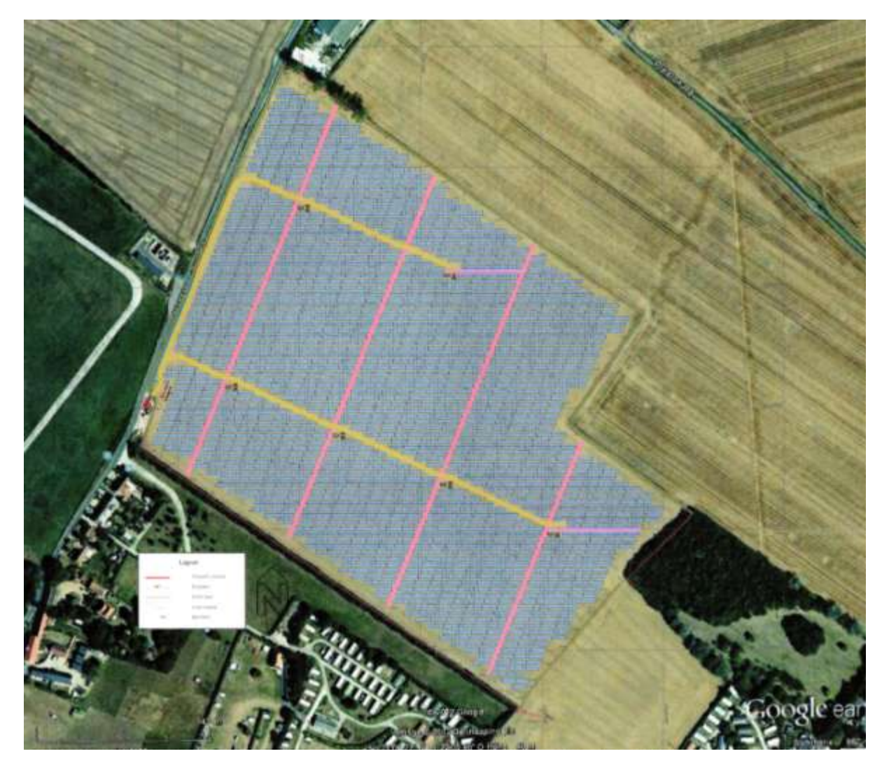
Fig. 2 Location of temporary access roads – in beige- and compound (south-west corner). Location of cable runs in pink.