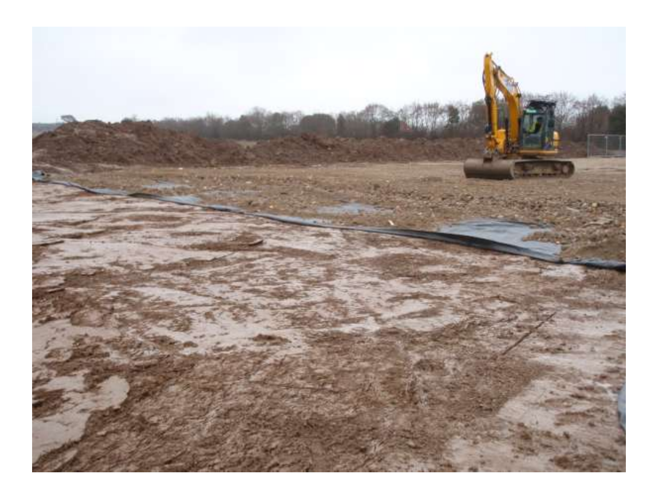
Plate 5. Compound being stripped and covered with Type 2 hardcore